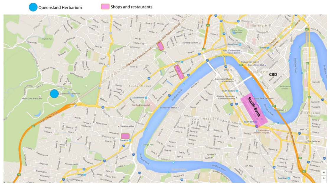
Fig. Location of Queensland Herbarium and nearest shops and restaurants

arrive in Brisbane so we can facilitate your visit.